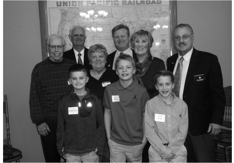
Americanism Winners and Committee Members