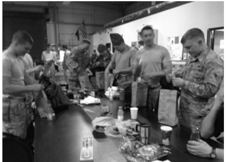
Member of 386th Opening Christmas Baskets from New Belgium Brewery and Lodge 804.

In November our Lodge partnered with New Belgium Brewing to provide Christmas baskets for the 386 th Air Expeditionary Wing Ali Al Salem Air Base, Kuwait. In gratitude, we received an American flag which was flown on a C-130H Combat Mission on the 18 th day of December, 2016, into the country of Iraq. With great honor, we will display the flag in our Lodge. Pictured below are members of the 386 th Expeditionary Wing receiving their gift baskets.