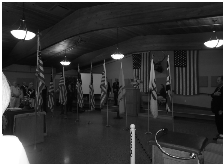
US Flags Over The Years