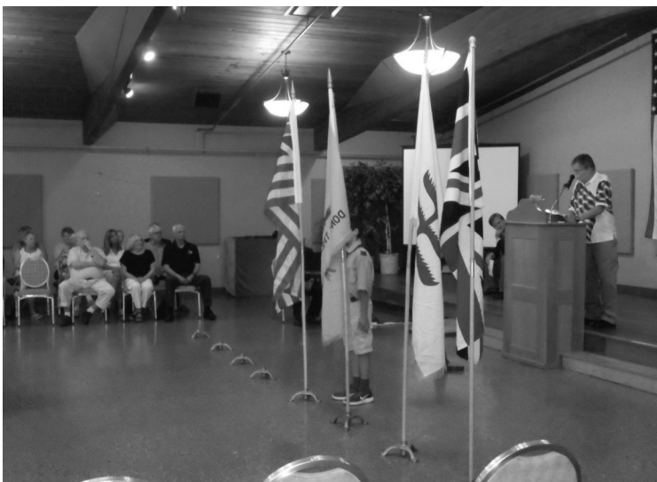
Flag Day Ceremony