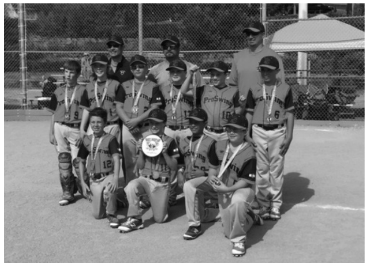
Youth Baseball Team 804 Sponsored won the Rocky Mountain Invitational 10u Tournament