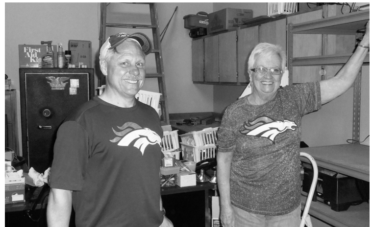
Volunteers cleaning the Lodge