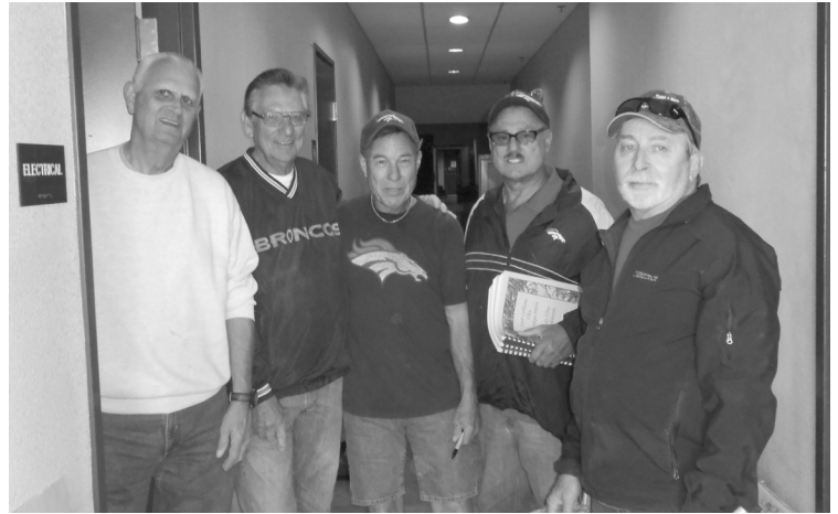
Volunteers cleaning the Lodge

So long as there are Veterans they will never be forgotten.