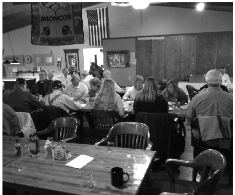
Veteran's Day Breakfast