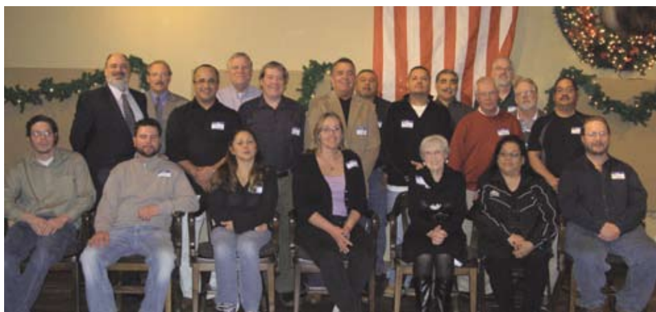
‘Class of December 20, 2011’