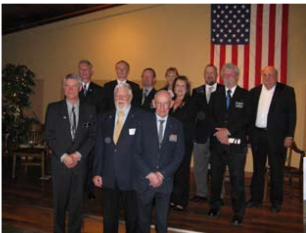
2012-2013 Lodge Officers